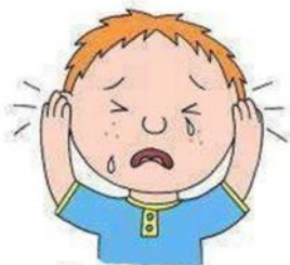
Oversensitive or undersensitive to sound