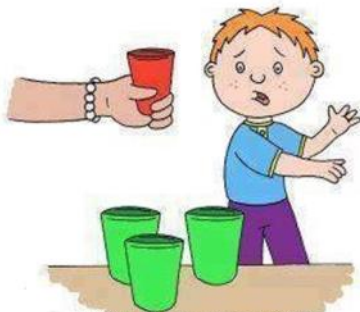
Difficulty dealing with changes to routine