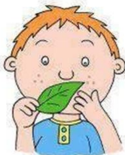
Strange attachment to objects