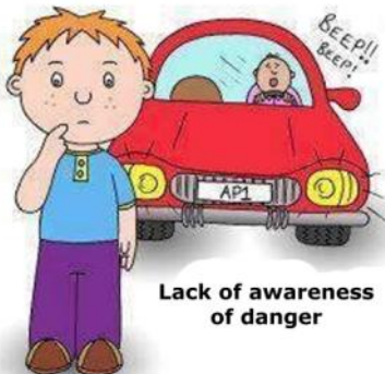
Lack of awareness of danger