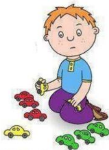
Inappropriate playing with toys