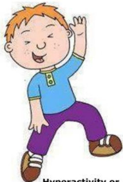
Hyperactivity or Passiveness