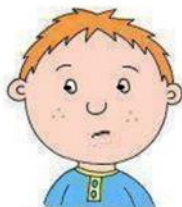
Lack of eye contact