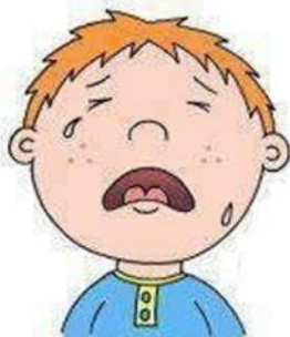
Inappropriate laughing or crying